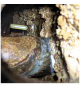
Large deposits of hard scale constrict water flow of this hotel plumbing system.