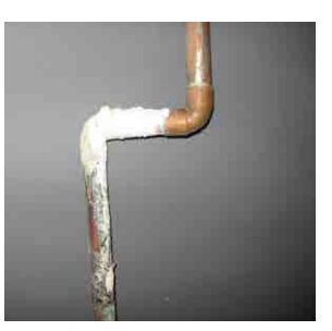
Hard scale build up on exterior of copper pipe in plumbing system.