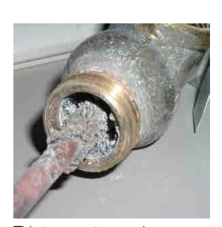
This temperature and pressure relief valve has become clogged with the accumulation of hard scale, which can lead to potentially dangerous conditions.